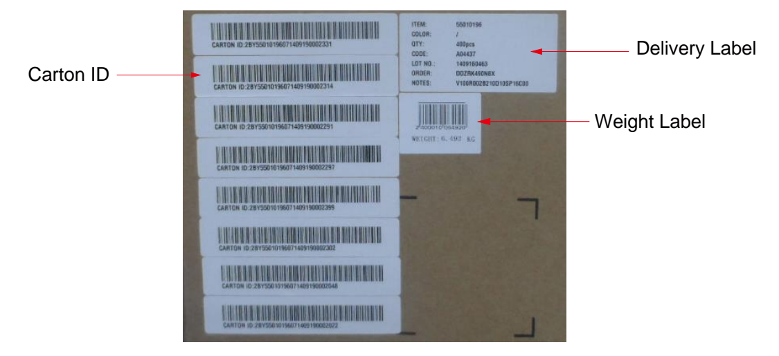
Figure 2-1 Large carton packaging

The first-layer packages for the MU709s-2 module are large cartons; the second-layer packages are medium cartons, and the third-layer packages are vacuum bags, as shown in the following figures.