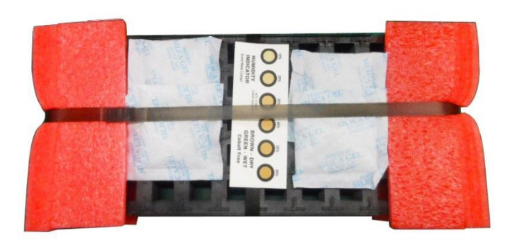
Figure 2-4 Arrangement of the modules (after the vacuum bag is removed)