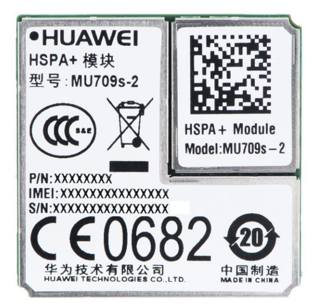
Figure 2-5 MU709s-2 label